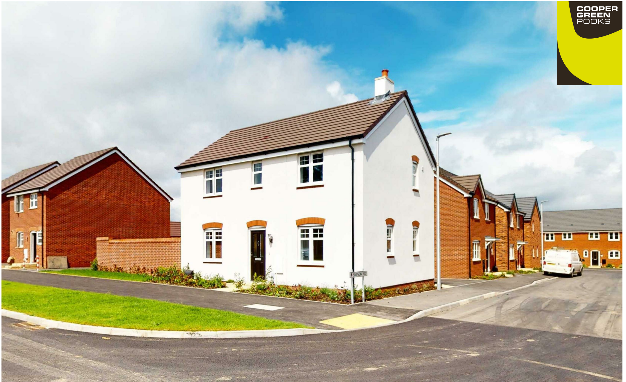
28, Maxfield Drive, Oteley Gardens, Oteley Road, Shrewsbury, SY2 6GE £1,350 Per Month